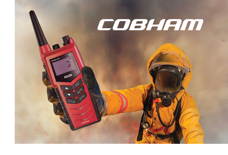
SAILOR 3965 UHF Fire Fighter